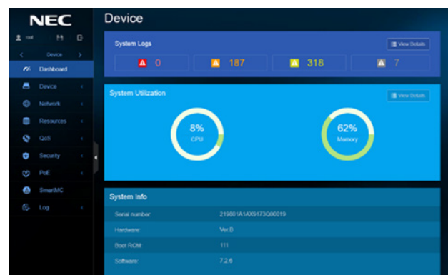
QX-S4100 Series WebGUI